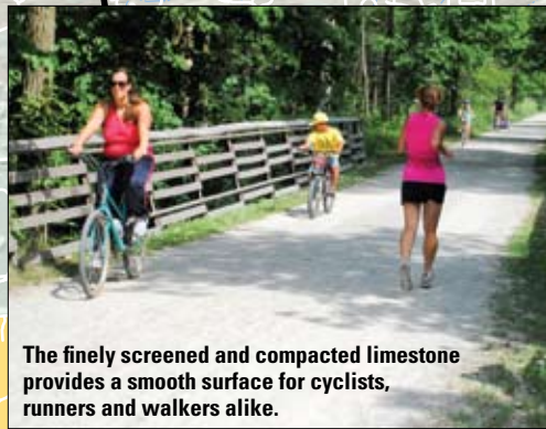
The finely screened and compacted limestone provides a smooth surface for cyclists, runners and walkers alike.