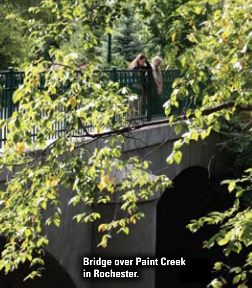
Bridge over Paint Creek in Rochester.