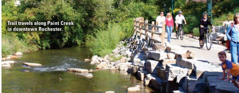
Trail travels along Paint Creek in downtown Rochester.