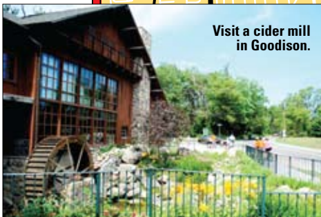
Visit a cider mill in Goodison.