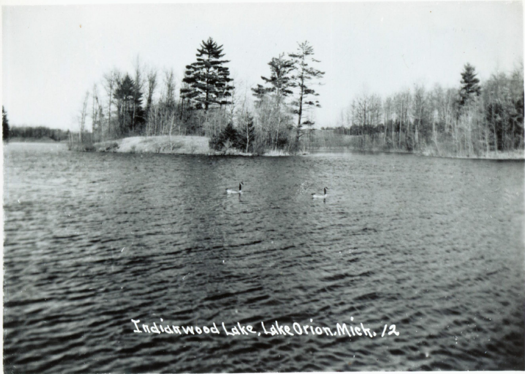
Indianwood Lake, Lake Orion, Mich. 12