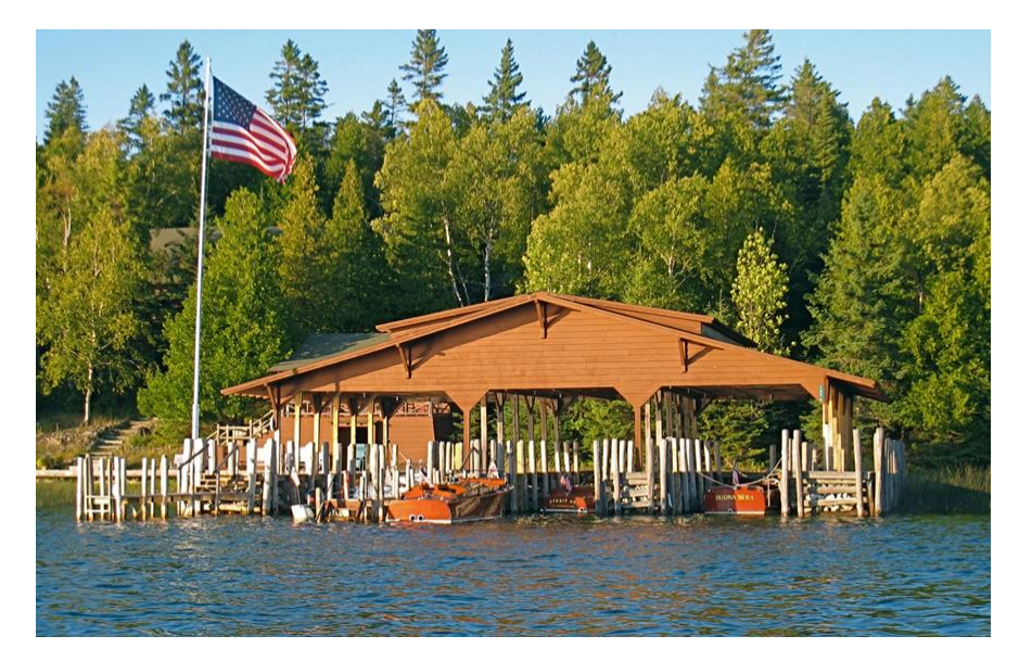
Total strangers will wave at you on the water. You'll happily reciprocate.