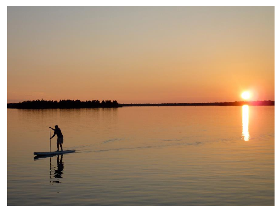
Then, there's classic boating. When you come here, you must bring yours! You'll be in great company.

For active adults and kids alike, this area offers so many summertime activities. Sailing, fishing, kayaking, paddle boarding, canoeing, birding (150 species), hiking, golf... The list goes on. Notice how none of these is costly or complicated.