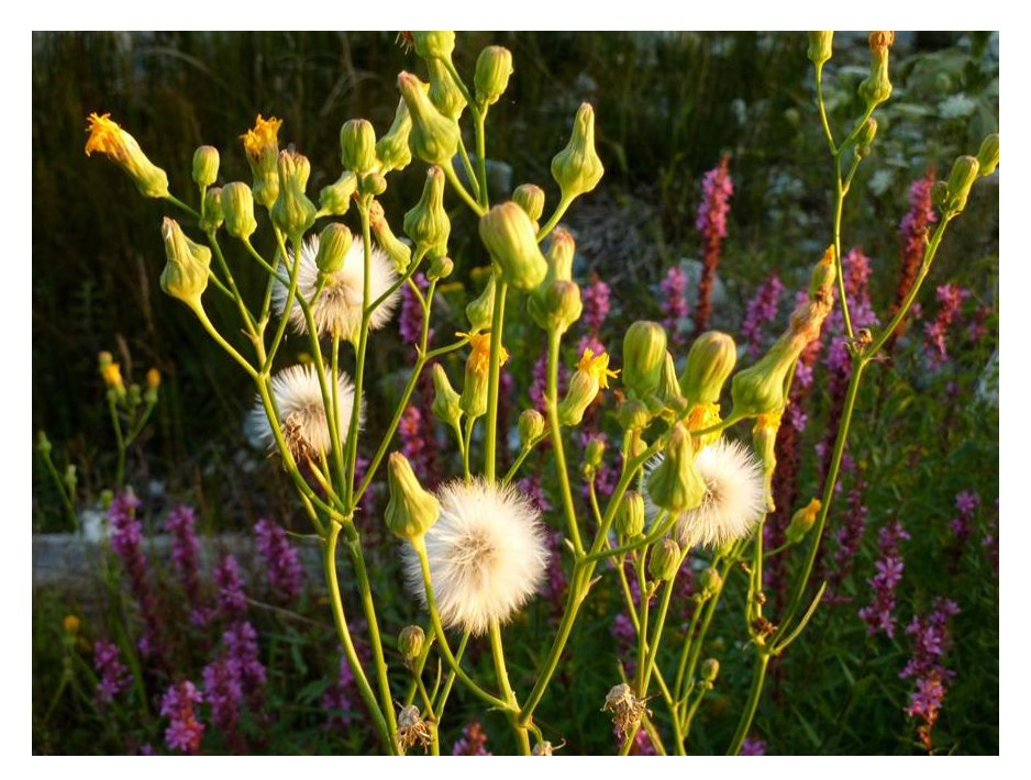
The wild swans, eagles, loons, ducks and great blue herons. The miles of unspoiled beaches — sugar sand in some parts...