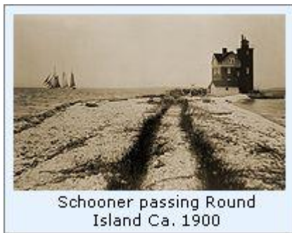
Schooner passing Round Island Ca. 1900

The area around the Straits of Mackinac is riddled with islands and reefs, which made vessel traffic at the transition from Lakes Huron, Michigan and Superior particularly difficult. While the construction of the Old Mackinac Point Light in 1892 eased the situation, the Lighthouse Board requested funds from Congress to augment the Mackinac Light