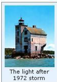
The light after 1972 storm

The second floor contained the keepers' kitchen, living room, dining room and one small bedroom. The third floor held three bedrooms, and a service room, which also provided access to the tower and lantern room by way of an iron ladder.