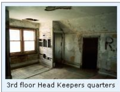
3rd floor Head Keepers quarters

A particularly violent storm on October 20, 1972 blew so hard against the building that one lower corner of the building was completely broken away. The resultant opening allowed access to vandals, who could not resist working their destruction on the once mighty building.