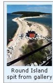
Round Island spit from gallery

A particularly violent storm on October 20, 1972 blew so hard against the building that one lower corner of the building was completely broken away. The resultant opening allowed access to vandals, who could not resist working their destruction on the once mighty building.